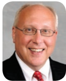
Jeffrey A. Holmstrand Law Institute